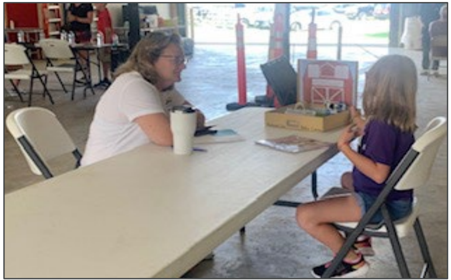
Shelby County 4-H member sharing her project with a judge at 4-H Project Judging

meetings (unless otherwise specified by the club) per year.