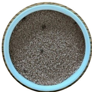
Trace Mineral Mix