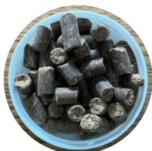
Pelleted Corn Gluten Feed