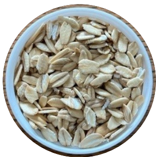
Steam Rolled Oats