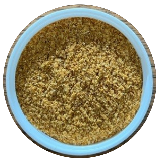
Corn Distiller's Grain