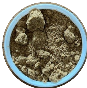
Meat and Bone Meal