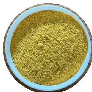
Corn Gluten Meal