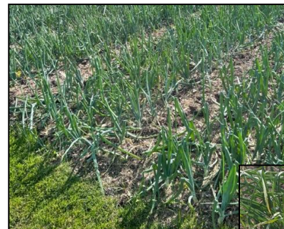
Onions were mulched with leaves.

No gardener has all the answers needed for the “perfect garden” rather we use our past experiences. Use what works for you, if you experienced a failure don't repeat it. Hopefully you are able to mulch this year and keep your insect pests at bay. As always, “Happy Gardening!”