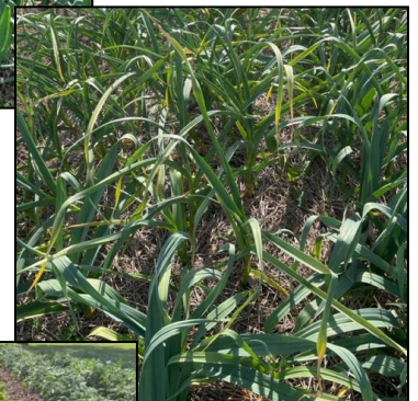
Garlic plants were mulched with straw.