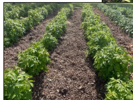
Red raspberries were mulched with cardboard & leaves.

June Meeting Wednesday, June 15, 2022 @ 2p at Extension only, no Zoom