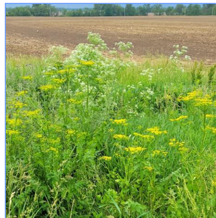
Wild parsnip (yellow) and poison hemlock growing together along Russell Road in Sidney.

Finally, and potentially more dangerous, is the threat of poison hemlock and wild parsnip. Both are now readily apparent along fence rows and in other undisturbed areas. Every part of PH is toxic to both humans and livestock – it's what reputedly was used to kill Socrates. WP, on the other hand, can cause serious blistering of the skin when exposed to the sun's rays. Joe Boggs wrote an excellent article with great pictures for the May 16, 2021, BYGL. It is entitled "Poison Hemlock and Wild Parsnip are Bolting and Blooming." You can find it by using the search feature on BYGL ( https://bygl.osu.edu/ ). Please educate your family members, especially the kids, as well as your friends and neighbors who frequent the outdoors. Don't let them be fooled by confusing these two with their harmless common relative, Queen Anne's Lace (AKA wild carrot).